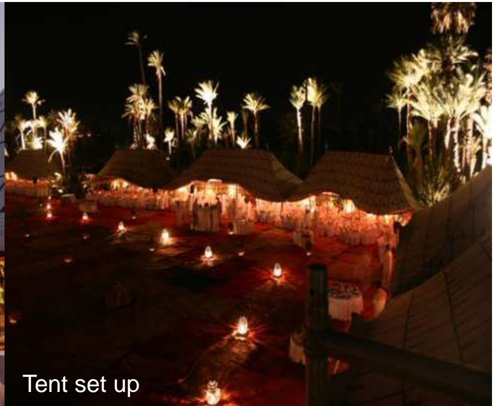
Tent set up