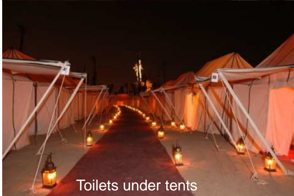
Toilets under tents