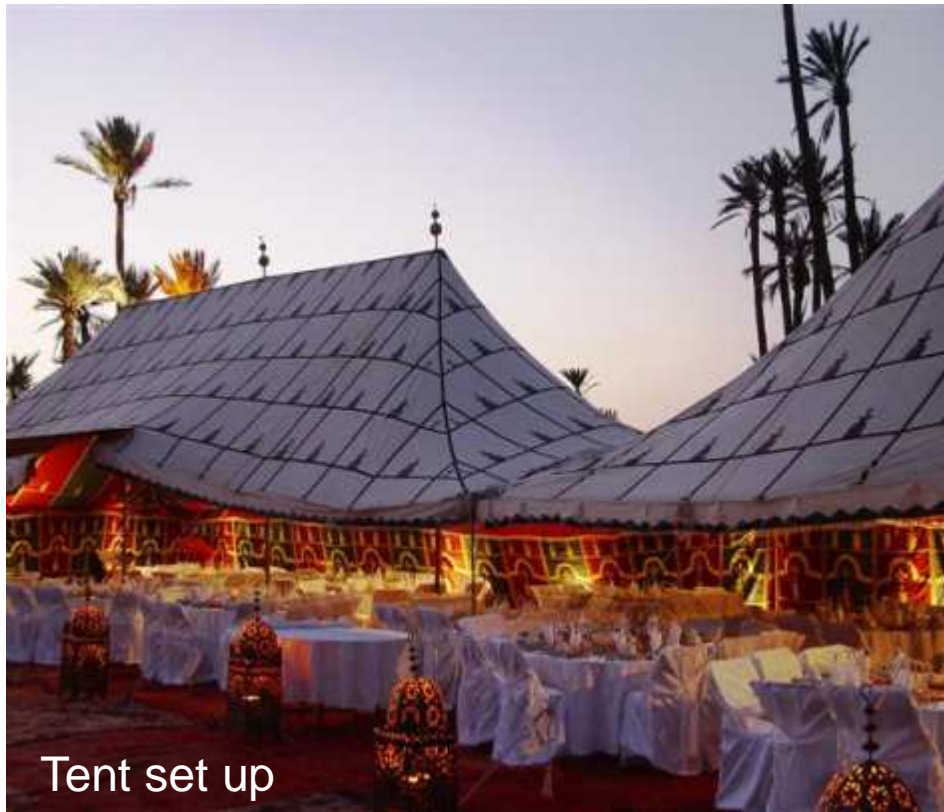
Tent set up